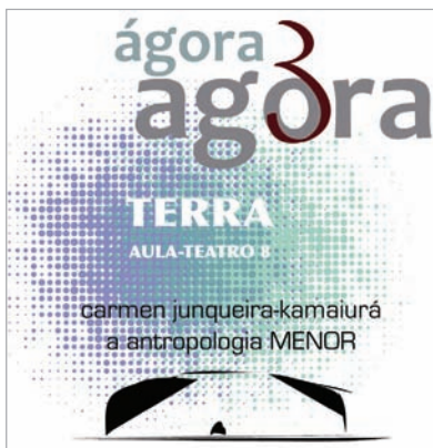
Image composition: DVD documentary carmen junqueira-kamaiurá – a antropologia MENOR; TV series ágora, agora 3; and aula-teatro, terr@

New institutionalizations. Effects of the enhancement of democracy into negative liberty, translated by the multiplicity of penalizations, into laws, norms and recommendations, producing