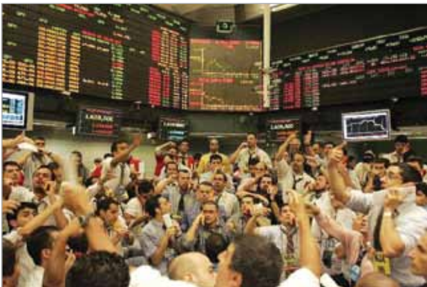
Illustration of a multilateral market: Commodity Exchange in Brazil (BM&F)

FAPESP Process 2008/56113-0 | Term: Jun 2009 to May 2013