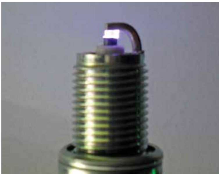
Figure 1. Spark plug electric discharge

FAPESP Process 2008/58195-3 | Term: Apr 2009 to Dec 2011