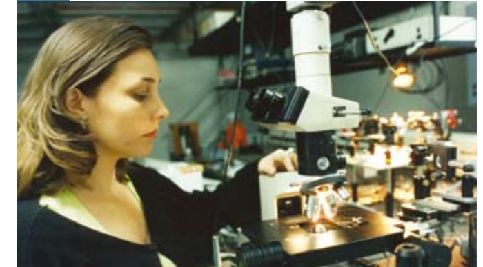
Confocal laser scanning biological microscope at the biophotonics lab

Eliane Valente (Education & Dissemination)