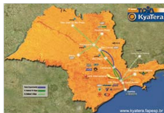
Institutions connected at KyaTera Project

Quantum processes for theoretical studies