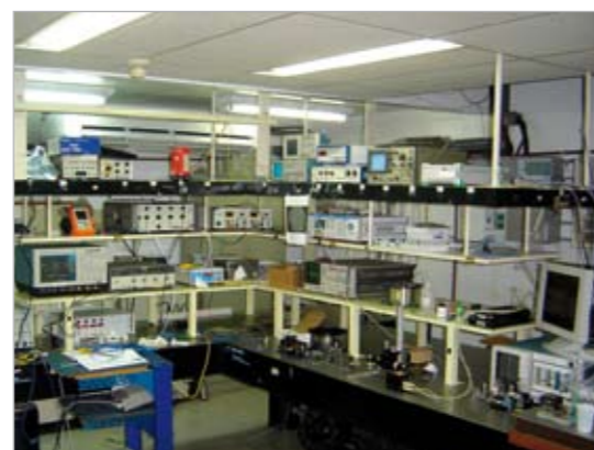
Optical Communications Lab